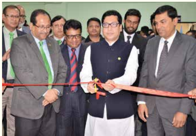
Hon'ble Minister of State, Mr. Farhad Hossain, MP, Inaugurating Vision Garden

triggering a healthy environment of mutual understanding and collaboration. Interspersed by cozy sitting arrangements, the lounge will also not disappoint the person who wants to enjoy a rare moment of solitude sipping a cup of tea/coffee.