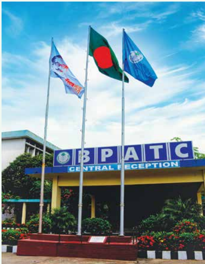
The Flags of Bangladesh, BPATC & Mujib Borsho Waving in Unison

Officers' Club and Ladies' Club of BPATC frequently organize cultural and social get together which eventually has created an environment of shared cultural values with the bond of warmth within the members of the centre.