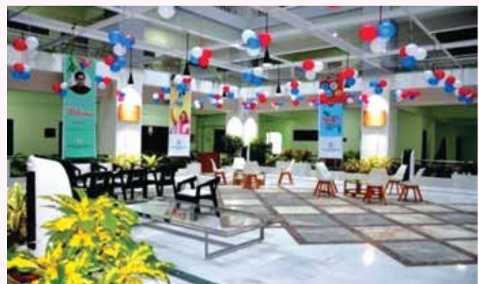
Colorfully Decorated Vision Garden

The architectural design and soothing ambience of the structure will play a catalytic role in bringing the participants from various strata together on the same platform where they can share their professional ideas